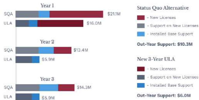
Cost Comparison for Database & Advanced Security Purchases